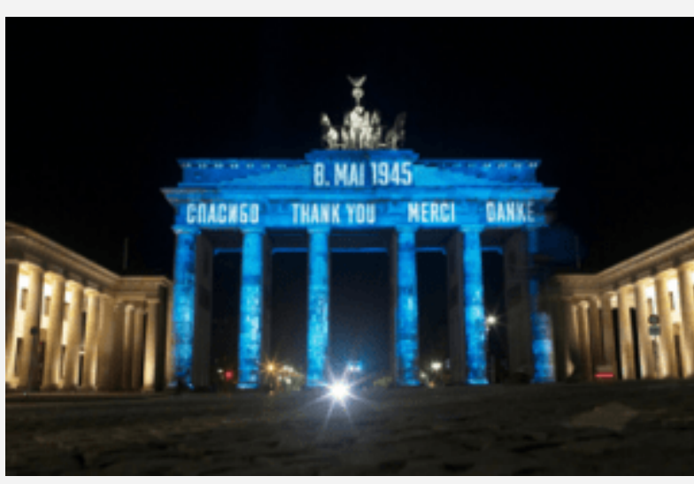
Day of Liberation, Berlin

being German”. Change of attitude and thinking is a long-term process. However changes do come, and I feel Angela Merkel, Chancellor of Germany, is one of many inspiring leaders of Positive Peace.